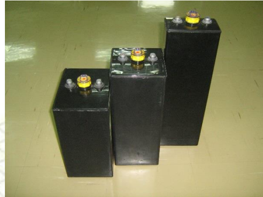
Stationary & Traction Battery