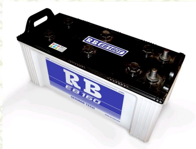
Deep Cycle Solar Batteries