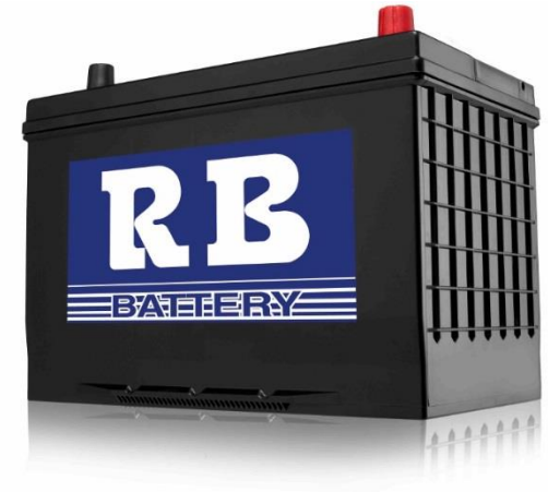
Sealed Maintenance Free Batteries